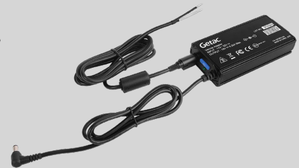
Bare Wire Version